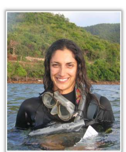
"CLP support helped me grow a nonprofit organization into a full-time operation."

<u>Supporting an alumni network</u> where CLP alumni connect to learn, share experience and help each other achieve their professional goals.