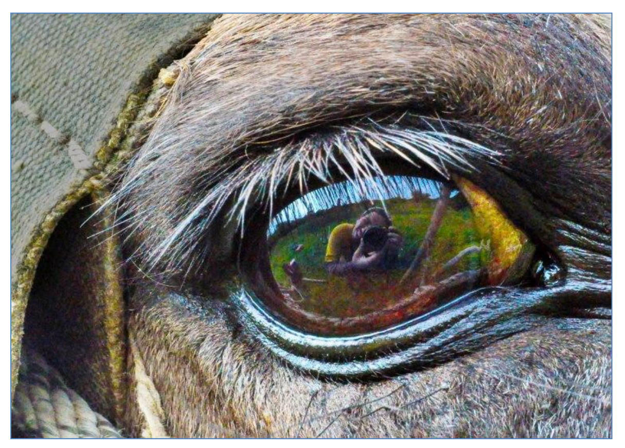
'Rural Eye' by CLP alum Aldemar Acevedo