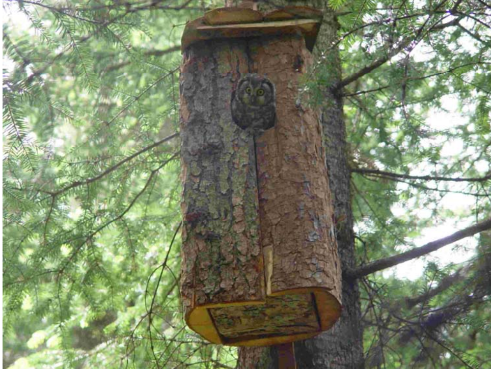
In 2003, we set up new type of nest boxes and they were looked more natural. This one was used by a boreal owl at the same year. (Nest box #81, 2003)