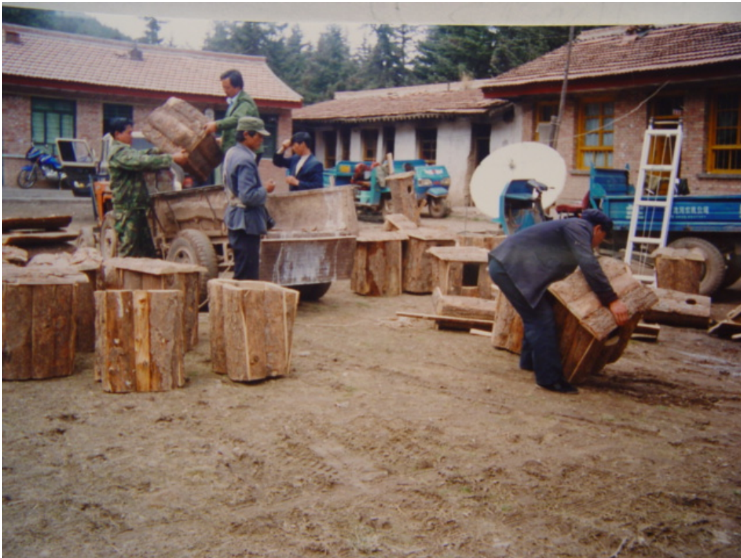
In 2003, new type of nest boxes were transported to the station and set in the forest.