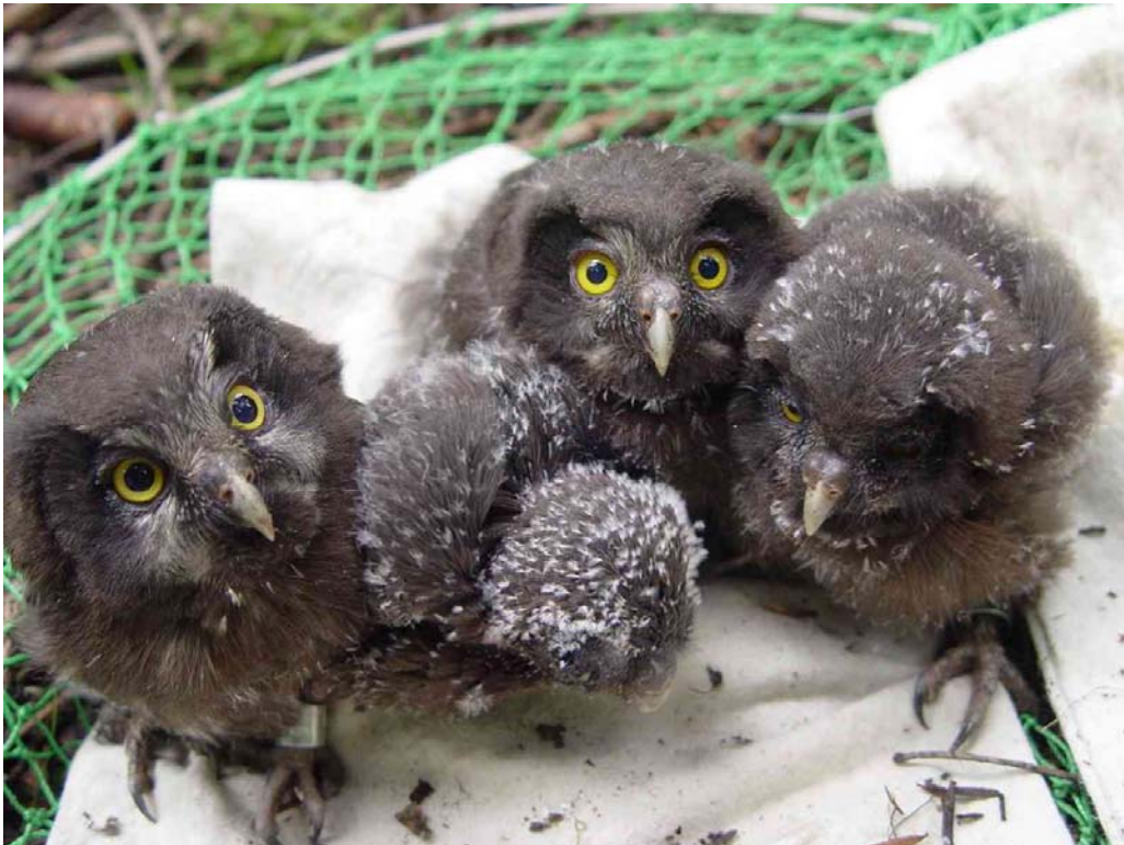
Four lovely young Boreal Owls from our nest-box 81. On 18 July 2003, they were marked with numbered aluminum foot rings, and we wish we could see them if they would use our nest-boxes in the future years.