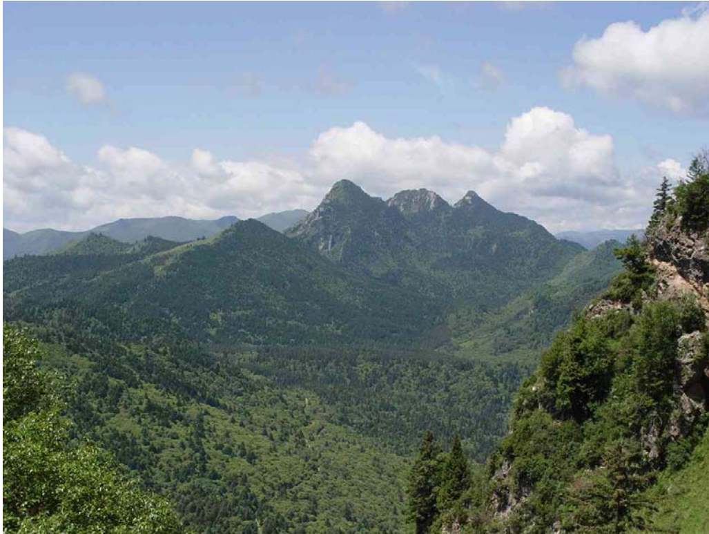
The landscape of the Lianhuashan Mountains.