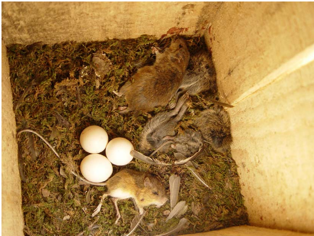
The eggs of the Boreal Owl. The owls stored food in their nests, from analyzing the stored food, we could learn the diet and reproduction status of the bird.