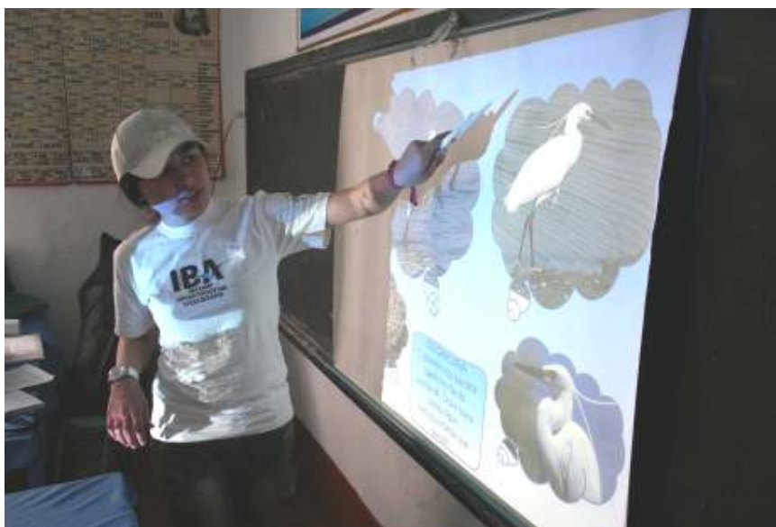
Fig.10 Presentation about birds species, Ayakaghytma school 14.04.2011

In May 2010 7 students from 2 universities participated in the first field training for students in Shavazsay. As the students were on a different level, many of them participating in a field work for the first time, we had to involve more experienced students in trainings. These students shared their experience with those participating for the first time. After such cooperative work on the preparation of a seminar for local people in Shavazsay, in September 2010 the students were able with their own efforts to make presentations for local people and tell them about their work. The students were still more active in the work with local people at Ayakaghytma, where they prepared and carried out their own programme (fig.10 and 11). To enhance a sense of responsibility and independence in the students was a very important point of the project, aimed at training future conservationists. We hope, these students will continue their activity in nature conservation, in which UzSPB renders technical assistance.