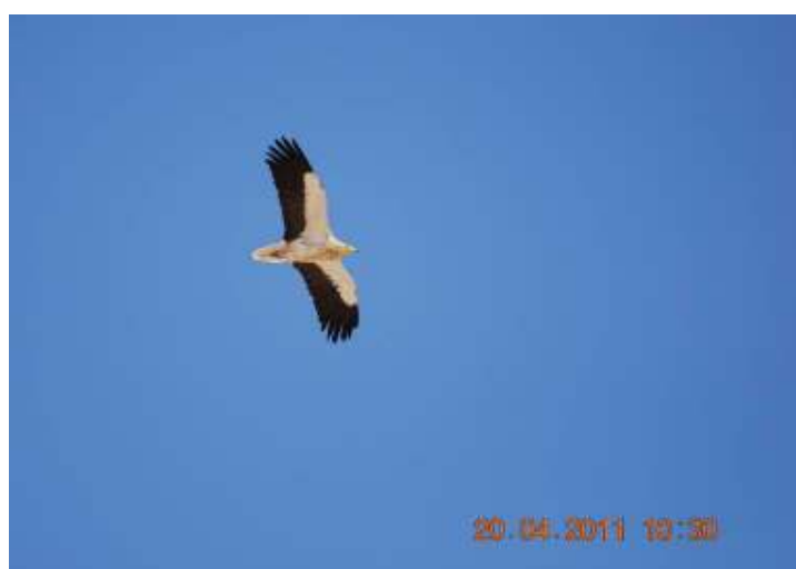
Fig.6 Egyptian vulture Neophron percnopterus on Ayakaghytma