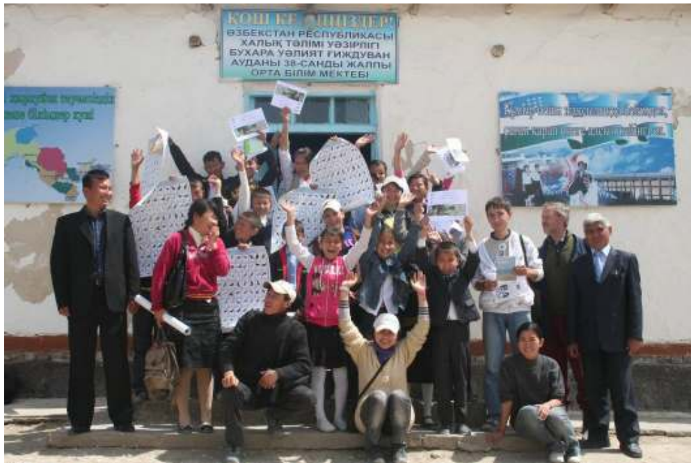
Fig.7 Participants of seminar on Ayakaghytma village, 16.04.2011