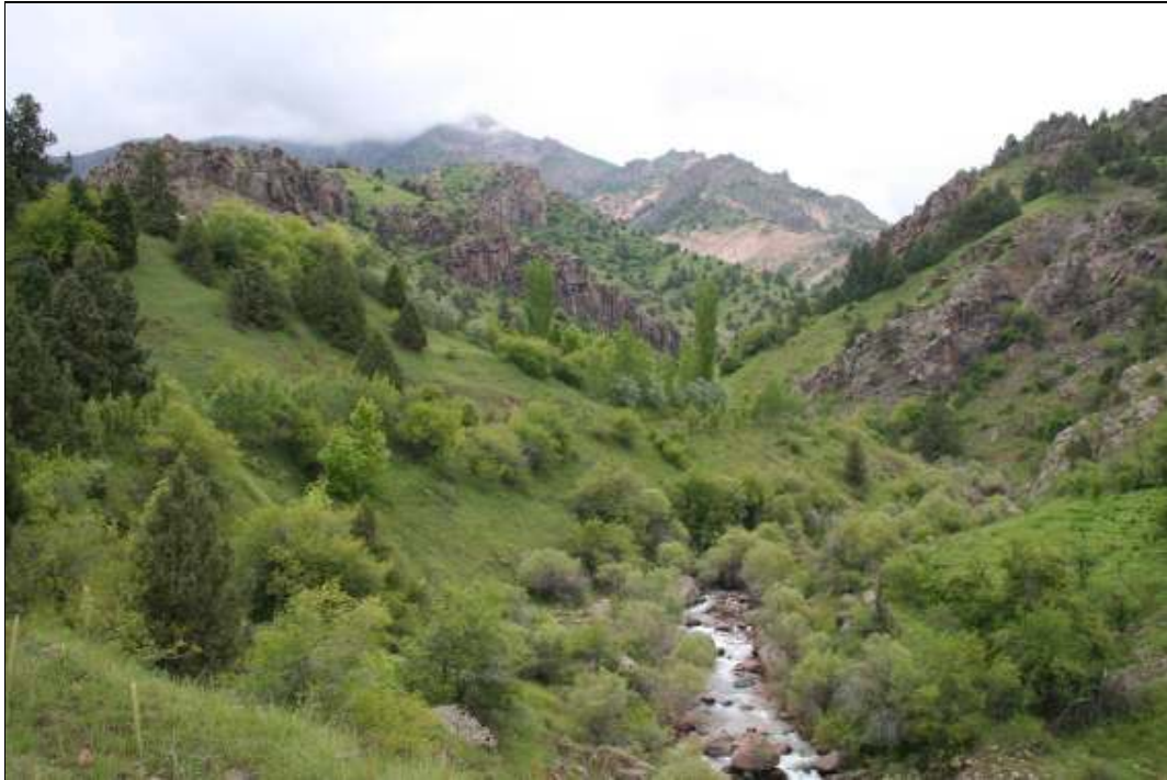
Fig.2 Shavazsay Gorge