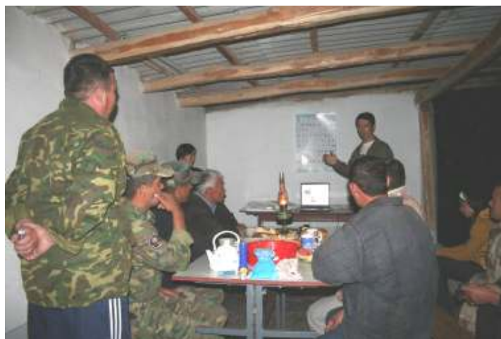
Fig.9 Presentation of IBA programme in Shavazsay, 27 September 2010