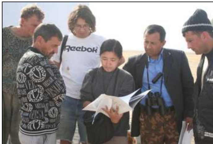
Fig.8 Familiarise fishermen with rare waterfowl of their region, Ayakaghytma 2011

The field survey carried out in the project territories revealed the general problem. All the project territories were either remote from settlements, as in the case with Akpetky and Sarykamysh, or were situated far from populous areas, as were Shavazsay and Ayakaghytma. All the territories have one common feature: direct dependence of land users and local community on natural resources (fish resources, pastures and firewood). Currently, excessive and irrational use – poacher fishing, overgrazing and deforestation – led to lack of resources. Therefore, the work with local population with the purpose of introduction of methods of sustainable use of resources and realization of necessity to conserve the biodiversity of their territory is of great importance. In the last expedition to Ayakaghytma we tried to pay more attention to local people and held a three-day seminar for pupils, in which we told them about birds and rare animals in their region, and familiarised them with the riches of their lands (fig.8 and 9). We hope that a link between UzSPB and the Ayakaghytma school was formed and the base for long-term collaboration founded.