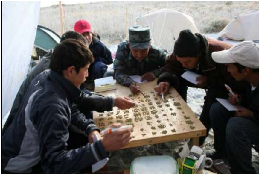
Fig.4 Field training: the interactive game on random count method, Akpetky 2010

The survey was carried out with the use of standard methods. The point count was used with lakes, while on flat sites and in mountains the survey was accomplished with line transects (Novikov, 1949; Colin et al.2005). All points and routes were recorded with the help of GPS, which were used in ArcGIS for making up maps with suggested boundaries for IBA. Birds were defined with the use of binoculars with x10 and telescopes x40 and x60. We used field guides: «Bird Guide: The Most Complete Field Guide to the Birds of Britain and Europe» (Mullarney et al. 1999) and «Birds of Middle East» (Porter, Aspinall 2010). Rare and little-studied bird species were photographed with camera with an objective 300 mm.