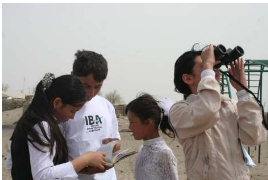
Fig.11 First steps in bird identification, Ayakaghytma school 15.04.2011