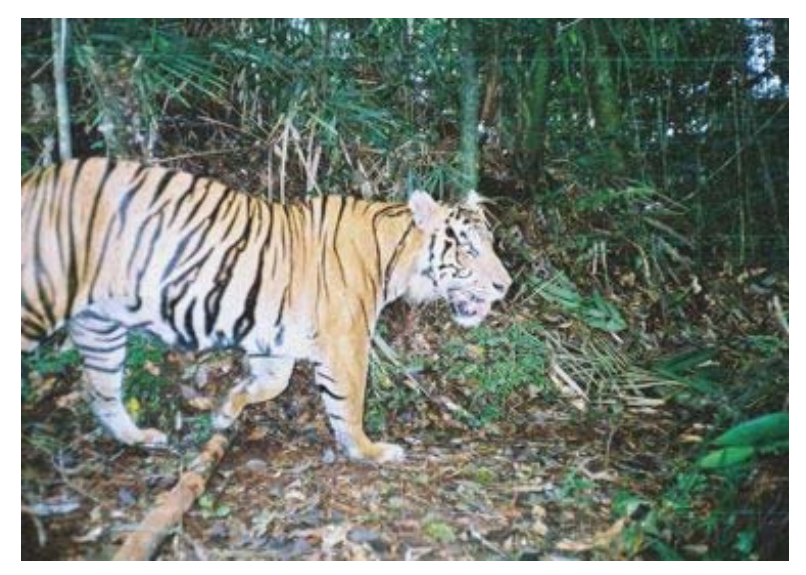
Plate 4. One of male tiger in BHPF