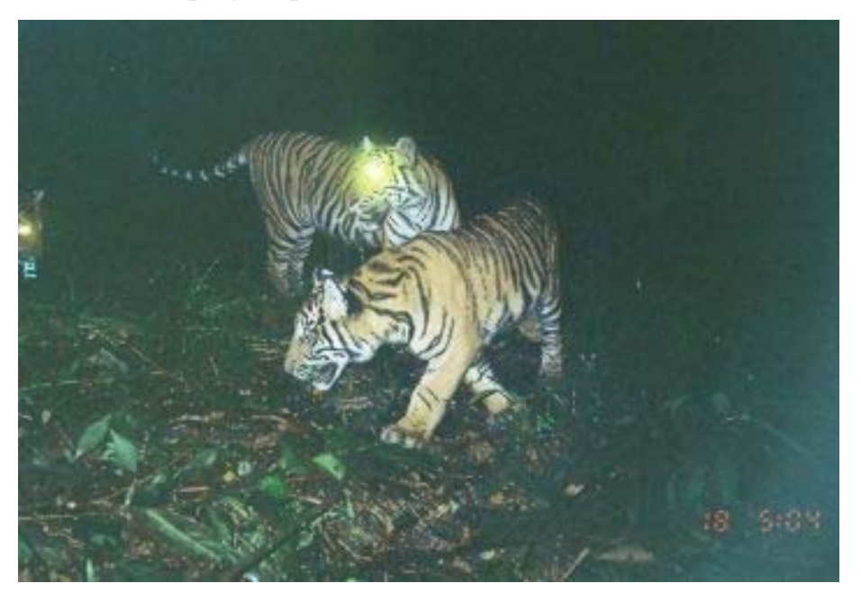
Plate 1. Tigress and two cubs