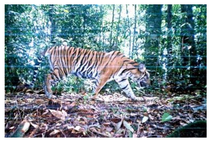
Plate 2. Tigresses walking along a forest trail during the daytime