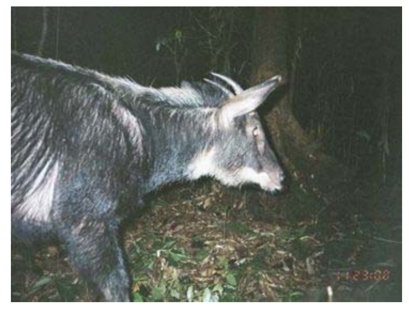
Plate 7. Serow, wild forest goat