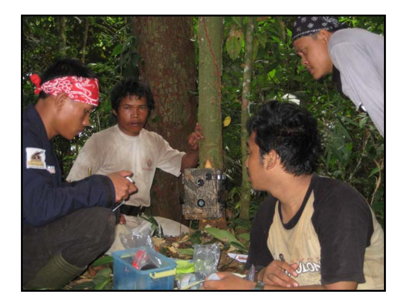
Figure 1. Project team members, student and local community members being trained to set up camera traps.

The project ran a two week training session for 6 personil, 2 the BKSDA (Conservation and Natural Resources Agency, Dept. Forestry) staff, 4 FFI-DICE tiger project team member and 1 Bogor Agriculture Institute (IPB) student. The training focussed on how to use field equipment, including GPS units, compasses and camera traps, as well as how to apply the most recent field survey methods. During the first field trip, the team coordinator trained all team members, 1 students (IPB) and 4 team members of the local community to set up the camera traps and make transects.