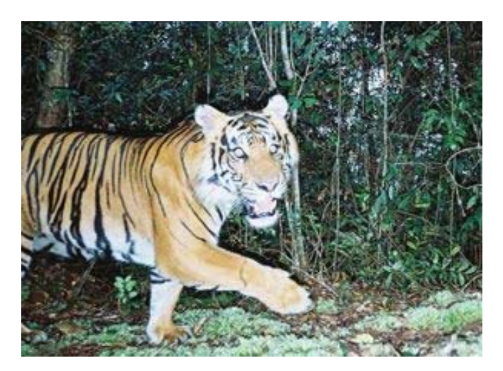
Plate 3. Male tiger passing along a ridge