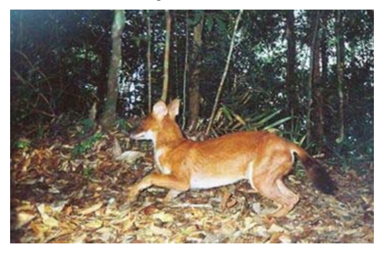
Plate 5. Asian wild dog, a rarely photographed Sumatran forest carnivore