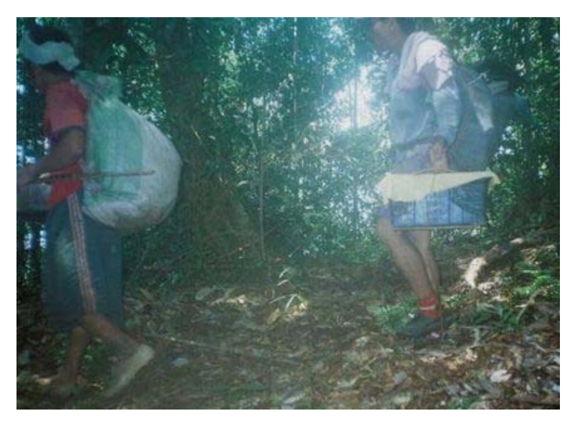
Plate 8. Bird poachers recorded inside the protected area