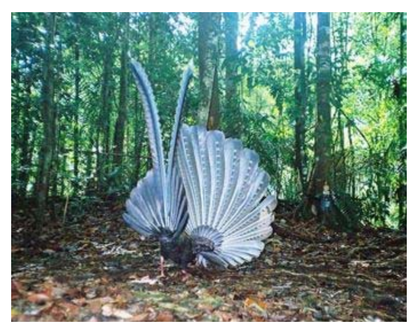
Plate 6. Great argus pheasant displaying in front of camera