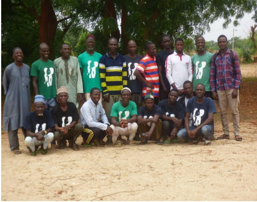
Fig.3- During a meeting with the elephant guardians.