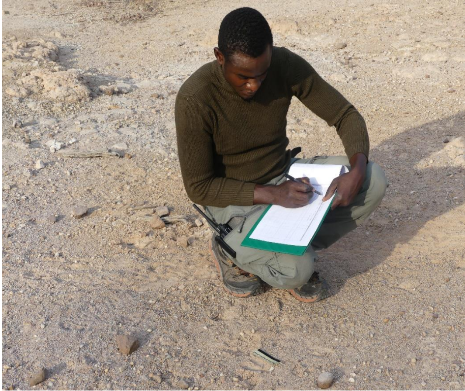
Fig.1-wild animal footprint tracking