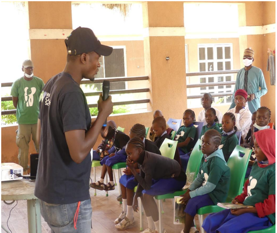
Fig. 2- conducting school visit.